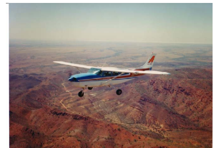
Arkaroola's Cessna 207 6 pax aircraft