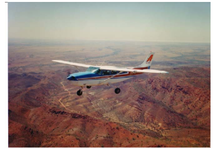
Arkaroola's Cessna 207 6 pax aircraft

"Star-trails" Stars circling the south celestial pole (Dodwell Observatory)