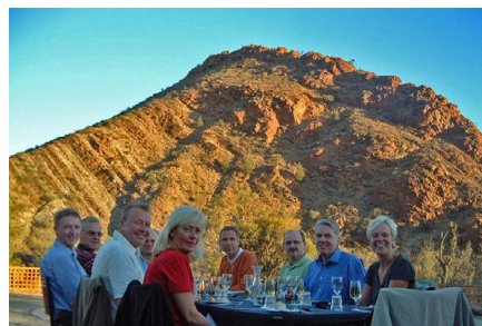
Banquet in the Bush (BIB)

Flights including Mildura to Arkaroola subject to weather conditions - we suggest travel insurance.