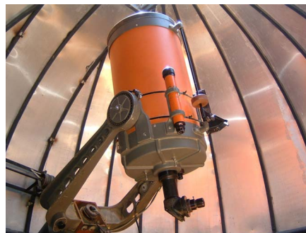
14-inch Celestron Schmidt-Cassegrain, computer controlled astronomical telescope. One of 2 used for Astronomical Tours